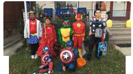
Readers' Halloween photos